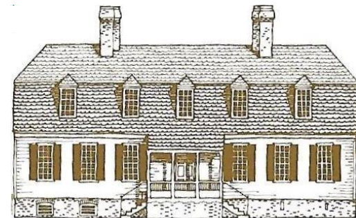
Williamsburg 2021 Day Award