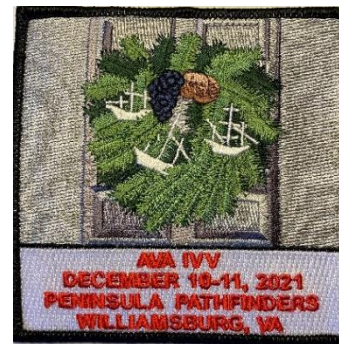
Williamsburg 2021 Night Award

AVA SPECIAL PROGRAMS: These walks qualify for the following special AVA programs: Little Free Library (6 & 11km only), Mayflower - 400th Anniversary Walk, Walking with America's Veterans, Virginia Cities Program: Williamsburg.