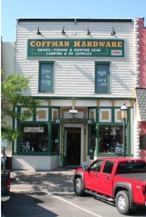
Washtenaw Wanderers Volkssporting Club©2020