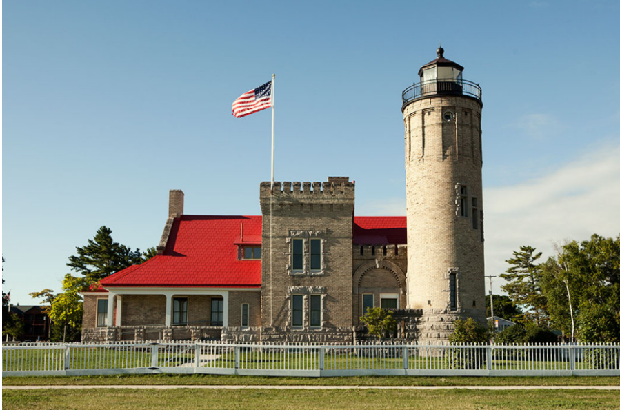
Washtenaw Wanderers Volkssporting Club©2020