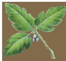
Poison Oak – “Leaves of 3, leave it be”. It will turn red in the fall and lose its leaves.

Please see www.klickitat-trail.org for more information about the trail.