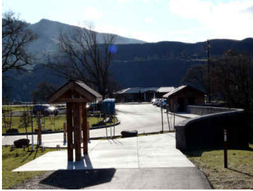
Klickitat Trail Trailhead