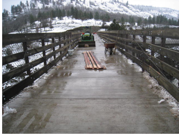
Fisher Hill Trestle bridge