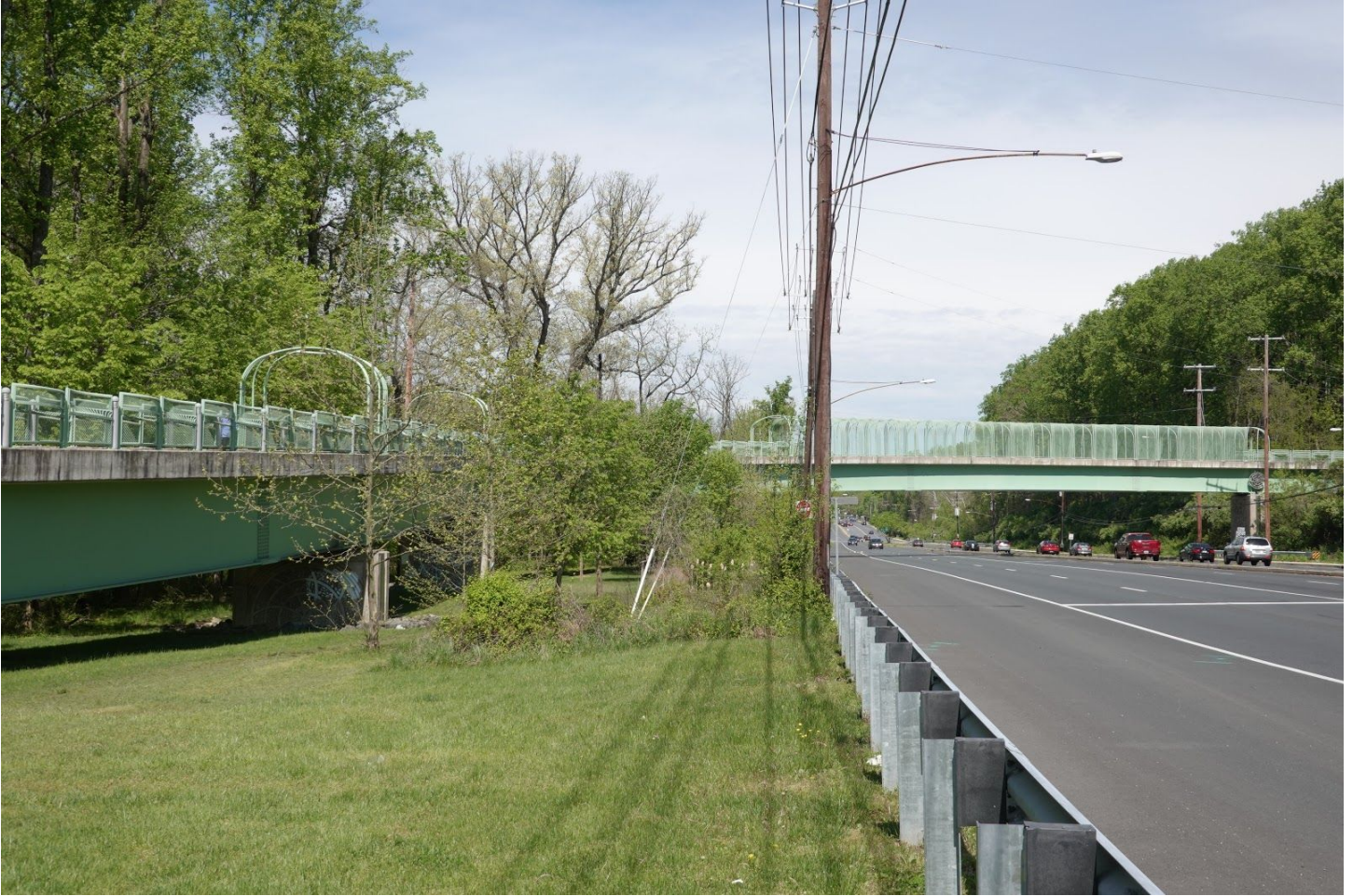
Rock Creek Trail Bridge over Veirs Mill Rd.