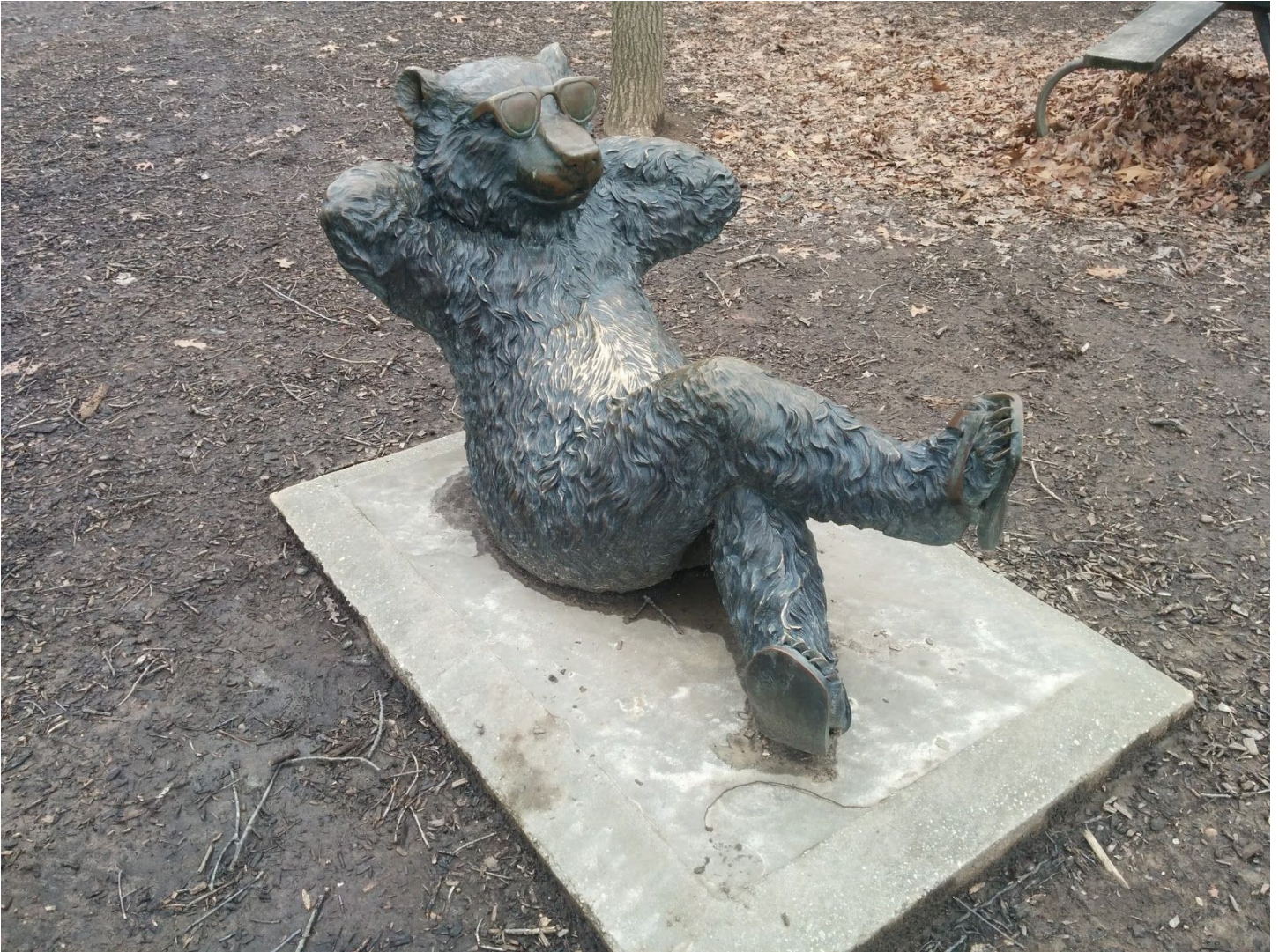
Sculpture at Lake Needwood near the Pavilion and Boat Rental Center.