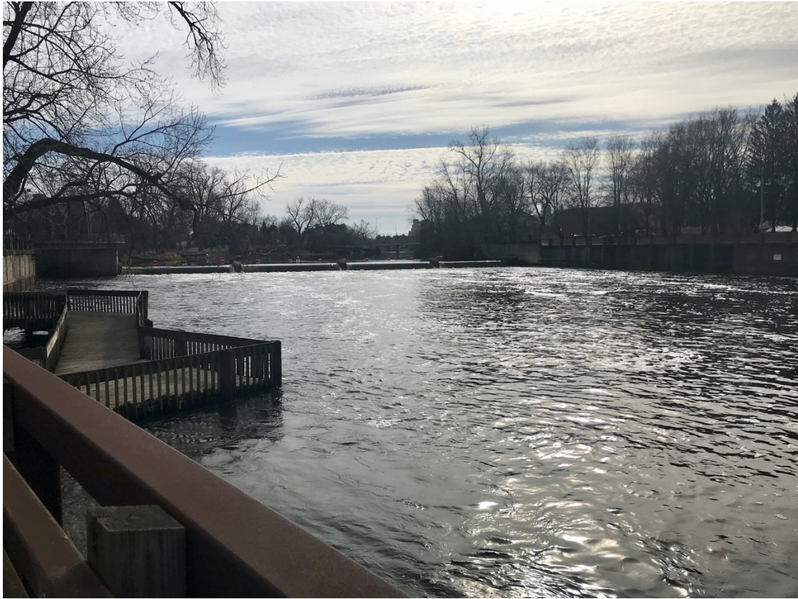
Washtenaw Wanderers Volkssporting Club©2020