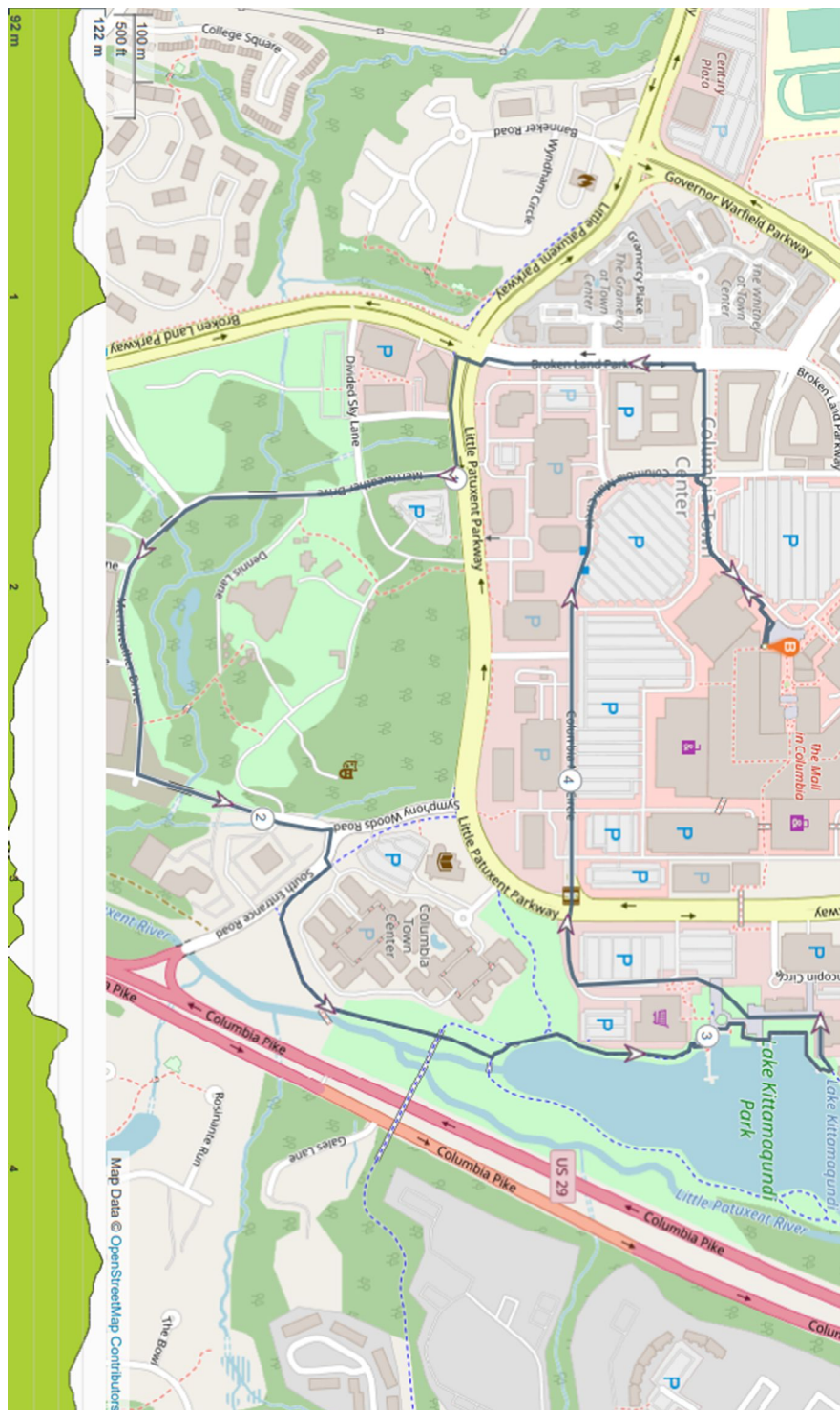
Columbia Mall Outdoors 5km

These walk directions and maps may only be used in conjunction with a signed American Volkssport Association athletic waiver. All other uses are prohibited.