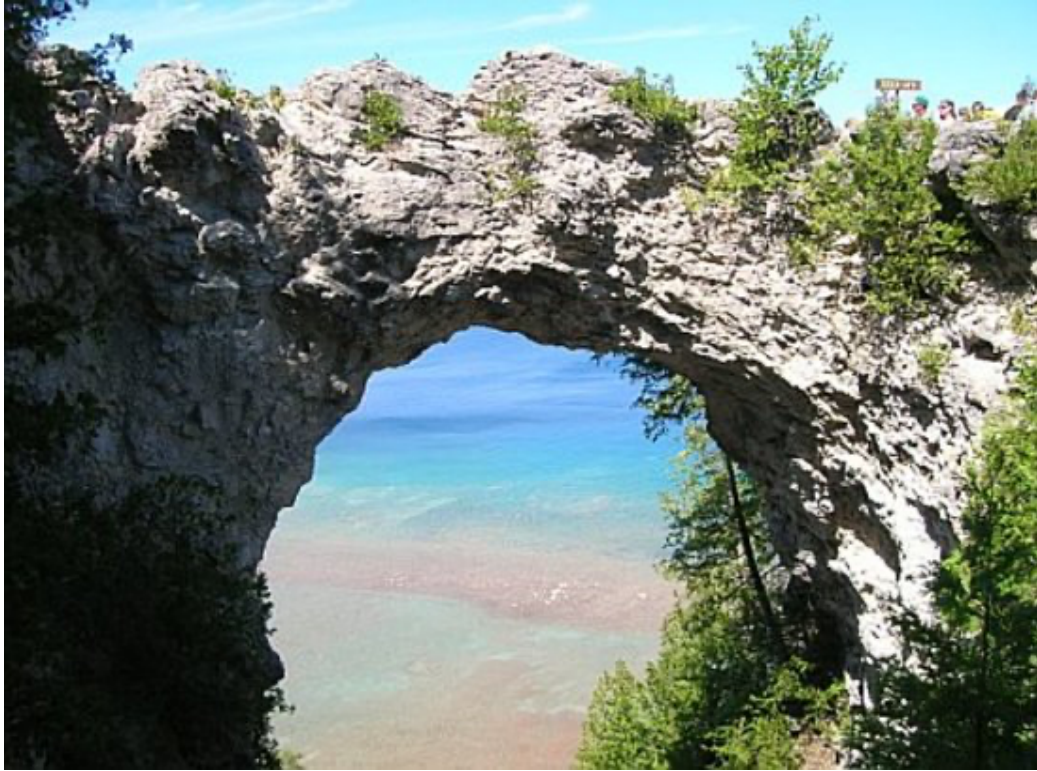
Washtenaw Wanderers Volkssporting Club©2020