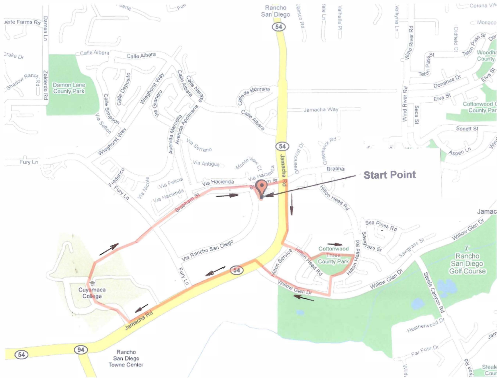
Rancho San Diego Library 5K Walk