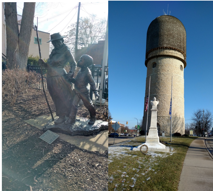
Washtenaw Wanderers Volkssporting Club©2020