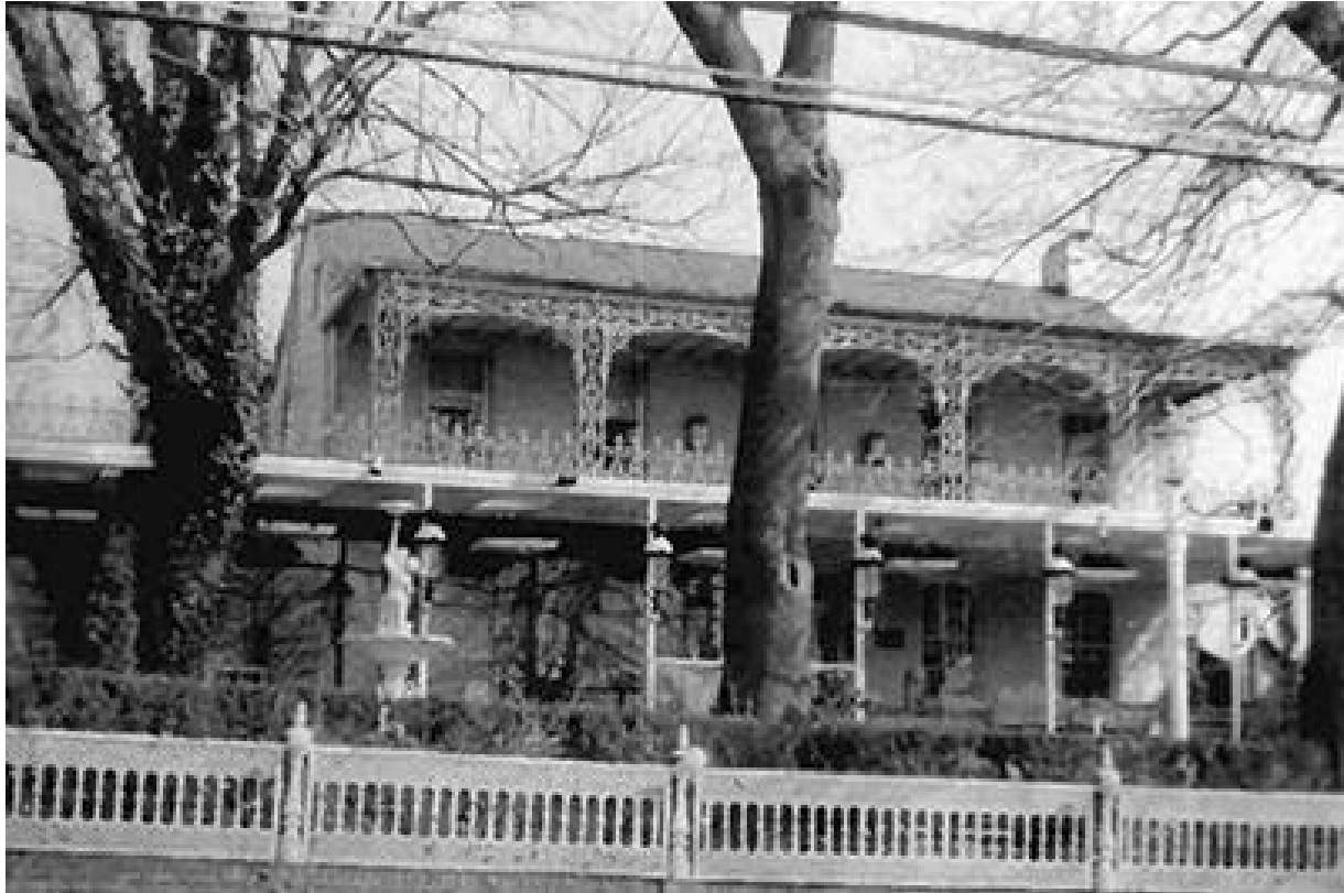
The Peter Pan Inn/Restaurant in its glory days.