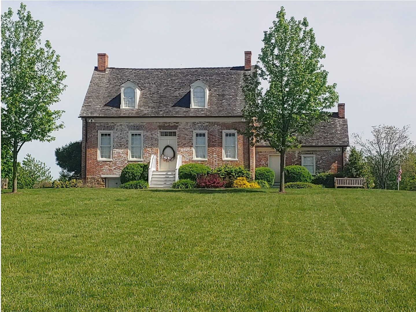
Fat Oxen House. Built circa 1775.