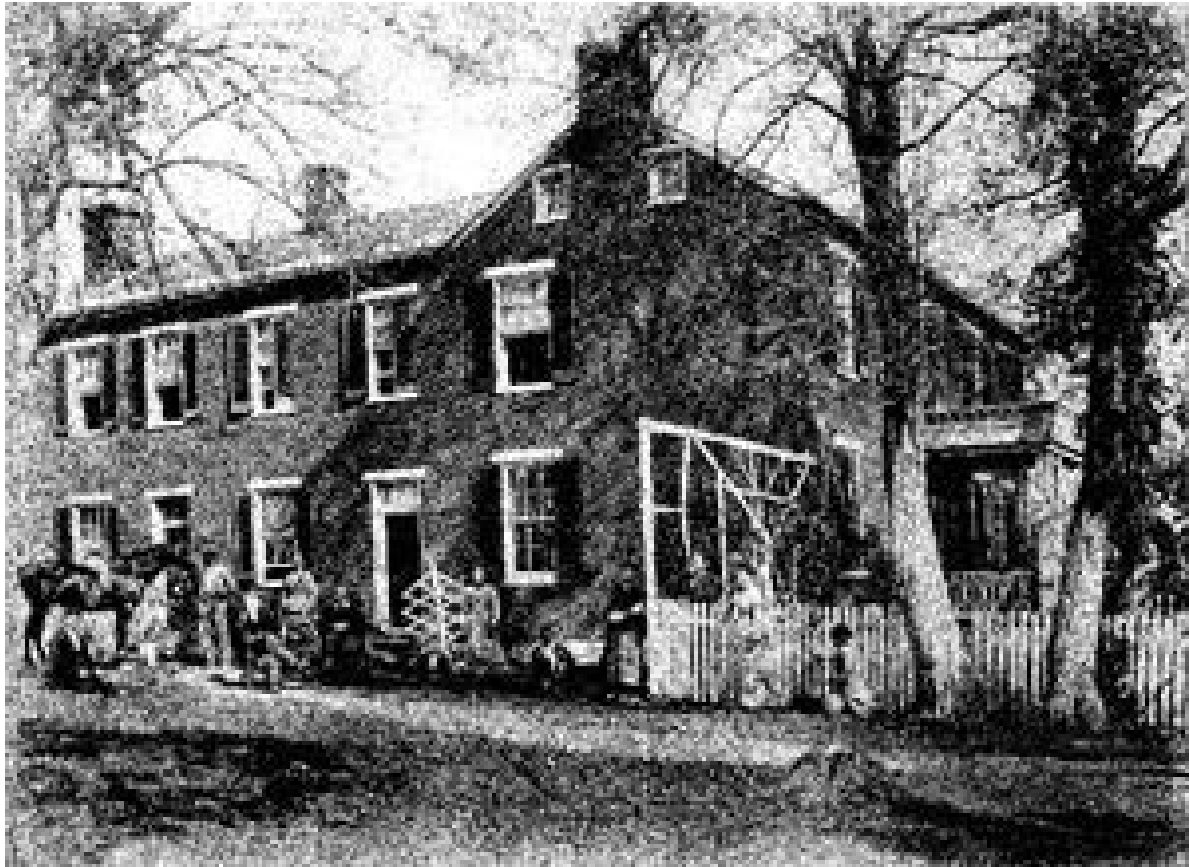
The Rine-Dixon House circa 1855.