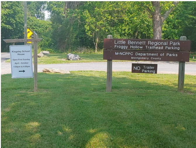
Trailhead Parking Area (5K and 10K).