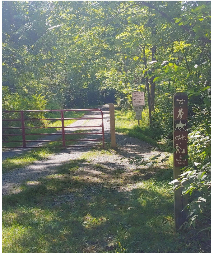
Kingsley Trail trailhead (5K and 10K).