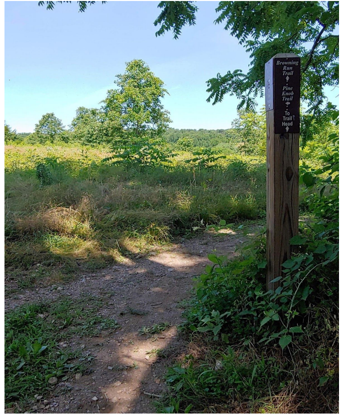
Browning Run Trail Post (10K).