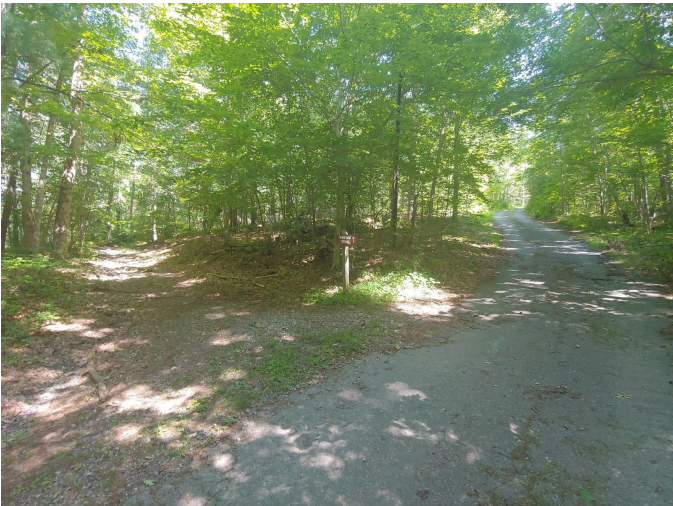
Purdum Trail on left (5K and 10K).