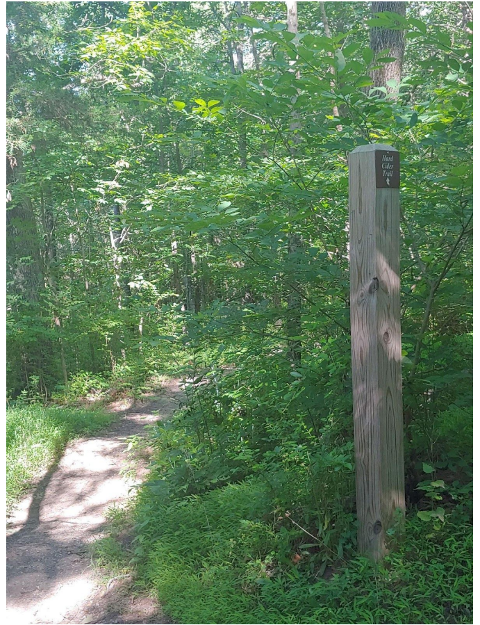
Hard Cider Trail Intersection with Purdum Trail (5K and 10K).