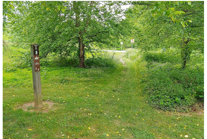
Browning Run Trail crossing of Clarksburg Rd (10K).