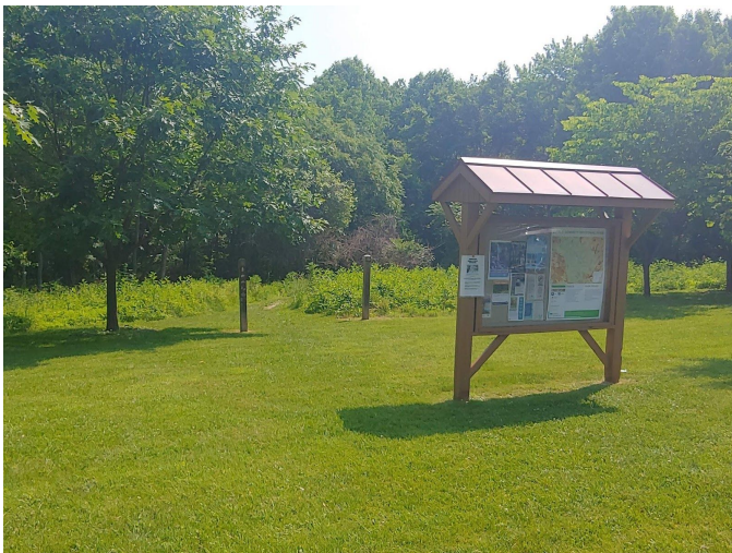
Froggy Hollow Trailhead (5K and 10K).