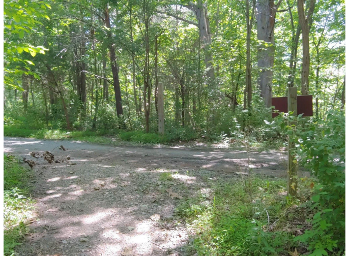
Intersection of Purdum Trail and gravel road. Turn LEFT (10K).