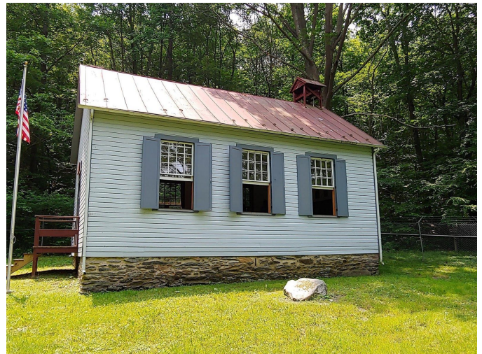
Old Single-Room Schoolhouse (5K and 10K).