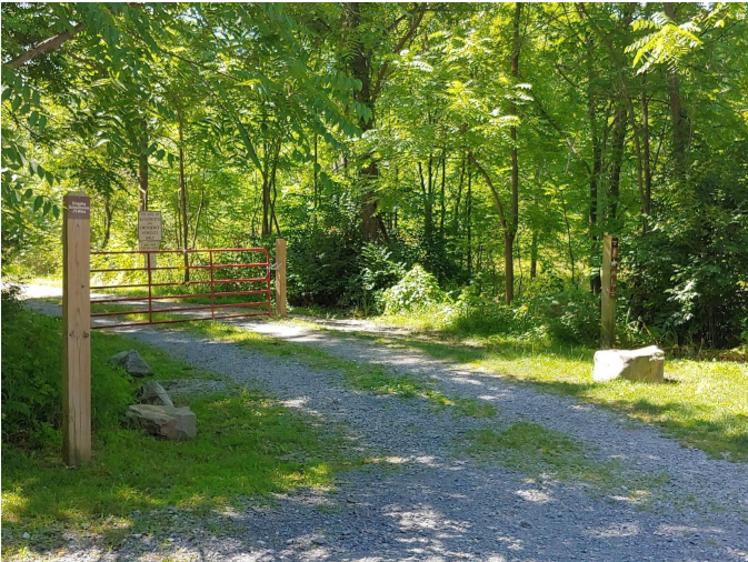
Kingsley Trail trailhead (5K and 10K).