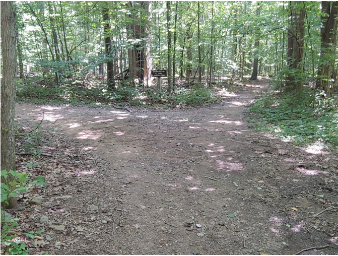
Intersection of Browning Run Trail and Purdum Trail (10K).