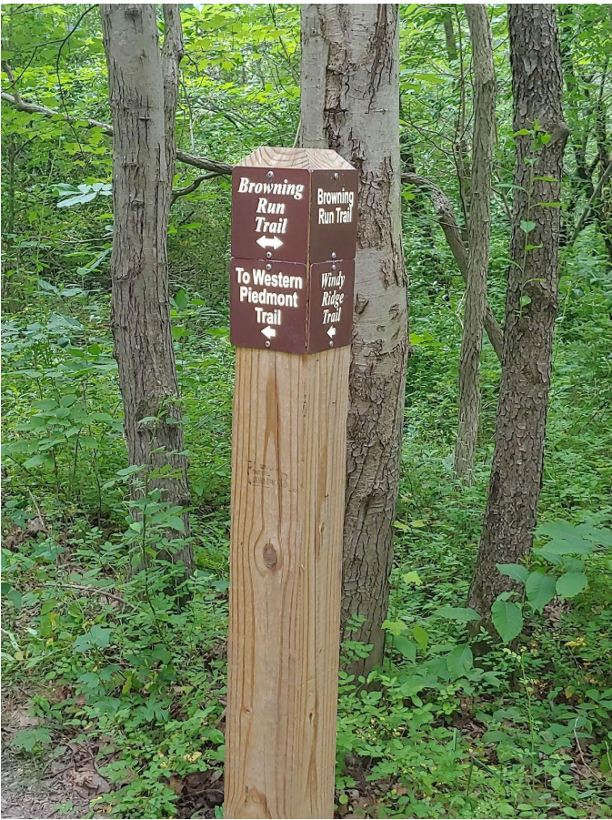
Browning Run Trail/Western Piedmont Trail Post (10K)