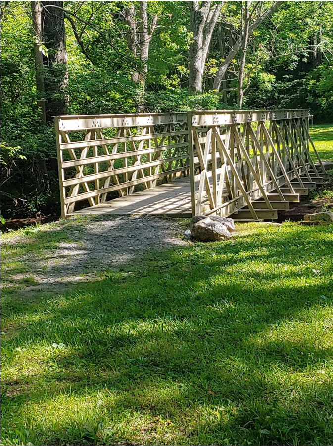
Bridge over Little Bennett Creek (5K and 10K).