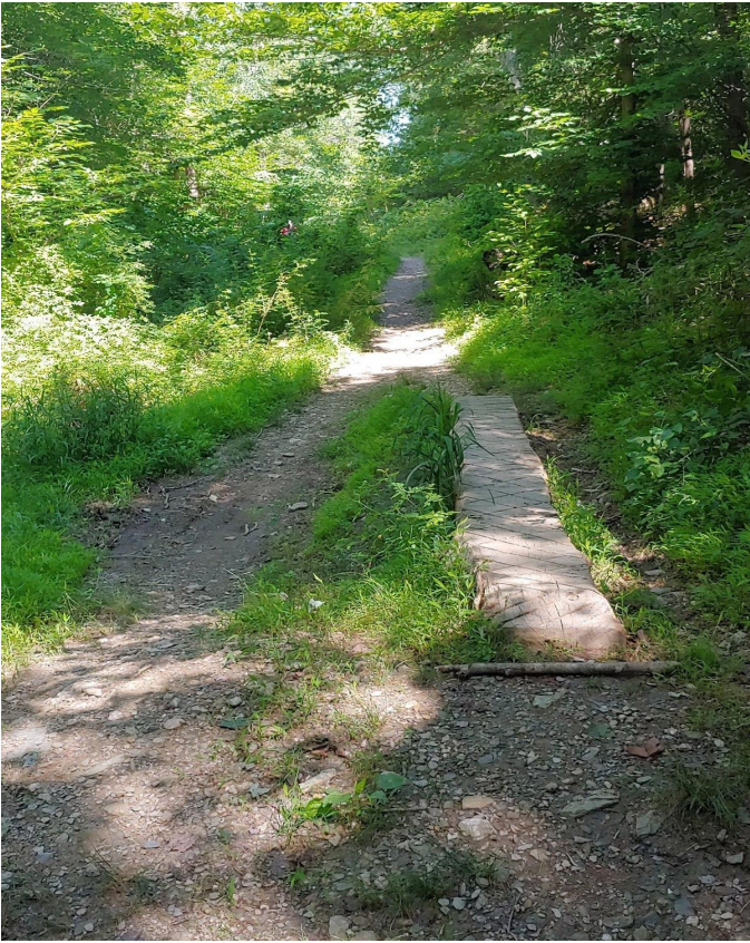
Log bridge (5K).