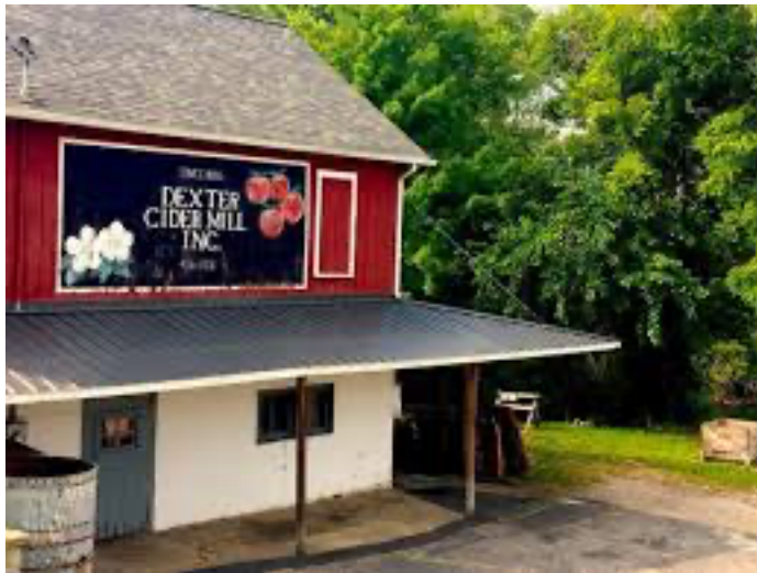
Washtenaw Wanderers Volkssporting Club©2020